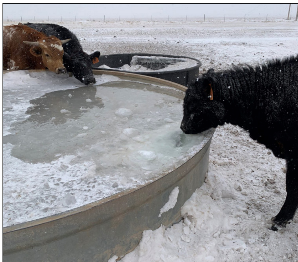
Beef cattle producers had to chip through a top later of ice so their livestock could drink.

"Beef cattle losses include estimated value of death