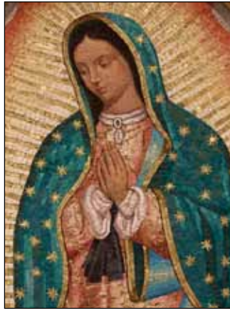
Our Lady of Guadalupe is patroness of the Americas,

Biden has previously referenced his son Beau's death from brain cancer as an incident where he relied upon his faith. In a 2020 campaign ad, he said that his faith supported him through tough times, noting that "I go to Mass and I say the rosary. I find it to be incredibly comforting."