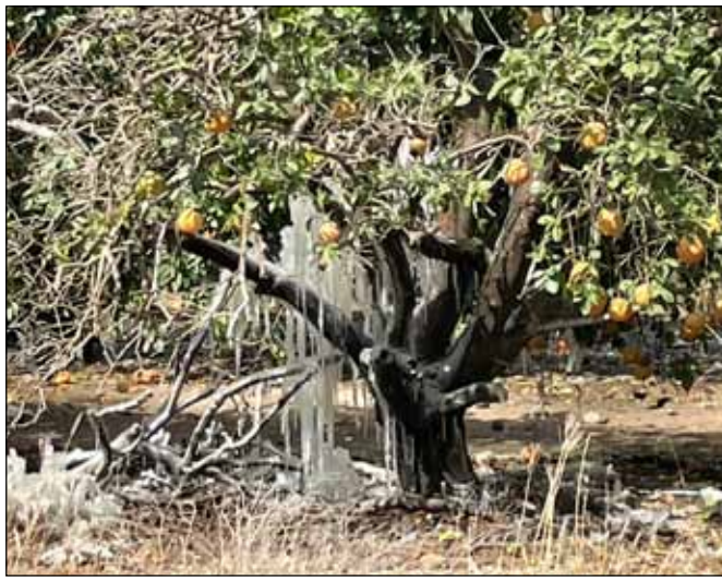
Winter Storm Uri left iced-over grapefruit tree in Rio Grande Valley.

Another agricultural sector that experienced significant losses was the green industry. AgriLife Extension,