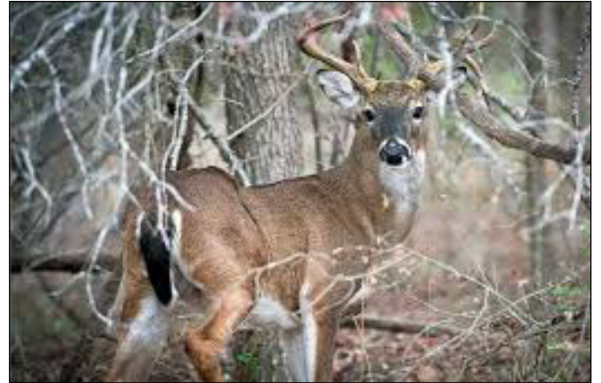
Because eradication is thought to be impossible once CWD becomes established in a population, it is imperative that TPWD work with landowners, hunters and other agencies to contain the disease.