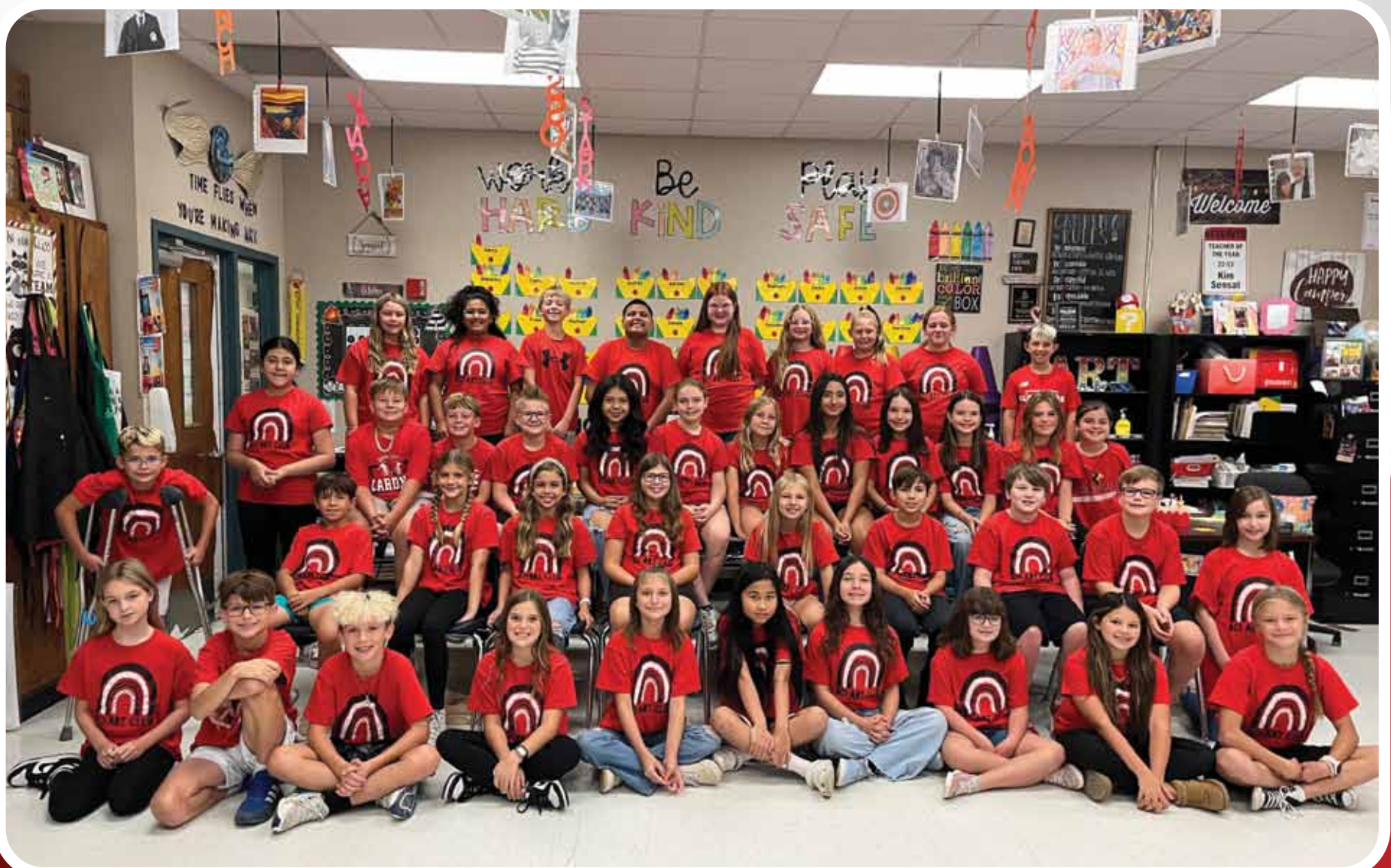
BCI Art Club has been busy getting their "Andy Warhol" scarecrow ready for the Scarecrow contest at Shangri La.