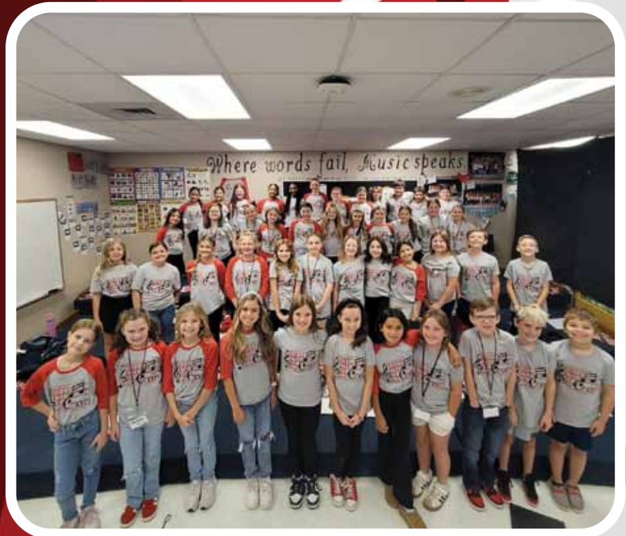
BCI Honor Choir members have been attending early morning practices to prepare for their annual Veterans Day Concert scheduled for November 8.