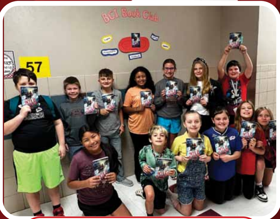
BCI Book Club recently read the survival story, Wild River by Rodman Philbrick. The story follows a group of students that overcome their differences and learn to work together as a team to survive. Students brainstormed items they would use in a survival situation and created a "survival kit" to use in an emergency situation.