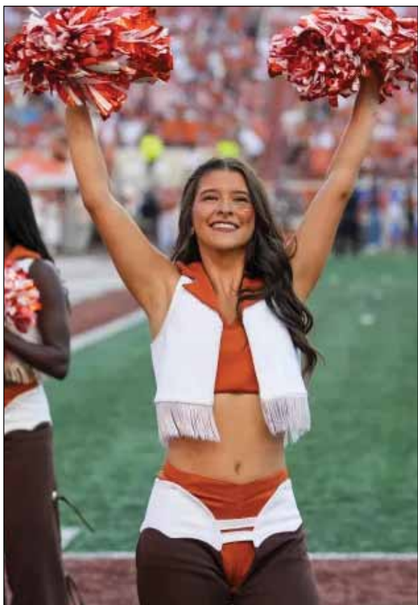
Texas Longhorns spirit squad member performing on field.