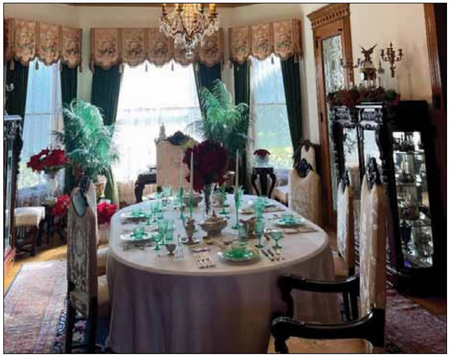
The 1894 W.H. Stark House in downtown Orange will have free evening tours of the decorated first floor on Wednesday, December 18, from 4:30 to 6:30 p.m.