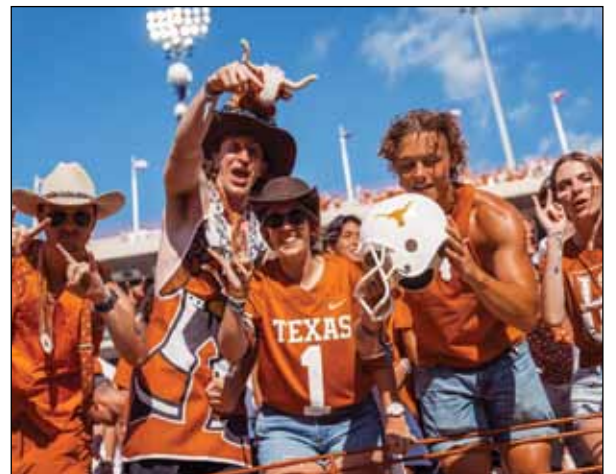
Texas Longhorns fans gear up for this weekend's College Football Playoff against Clemson.

This is the first-ever matchup between these two programs.