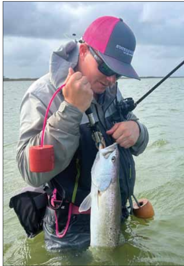
Anglers looking to score big winter trout have plenty of options to help their pursuit. . RECORD PHOTO: Capt. Chuck Uzzle

GOOD. 58 degrees. Waders picking up a few quality speckled trout from the back shorelines of the bay. Best on hard and soft plastic baits. A few fish coming from those drifting the reefs with live shrimp and soft plastics. Report by Captain David Dillman, Galveston Bay Charter Fish-