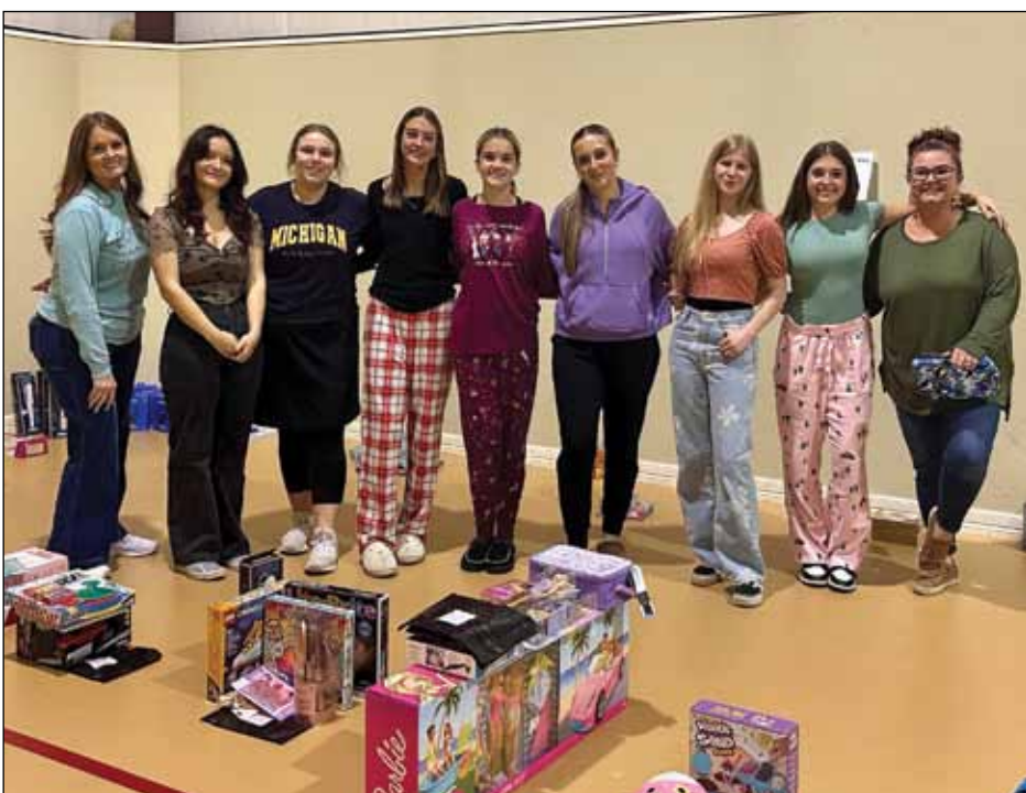
On Monday, December 9, several members of Orangefield's Uprising Club spent the day sorting toys to help the Bridge City/Orangefield Ministerial Alliance.