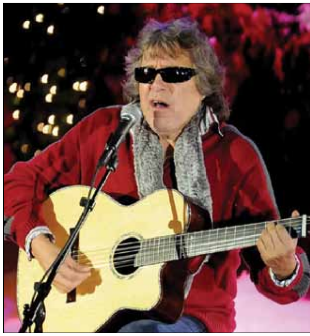
For another consecutive year, Texas' most popular song is José Feliciano's "Feliz Navidad."

In addition to finding each state's most popular song, FinanceBuzz also sur-