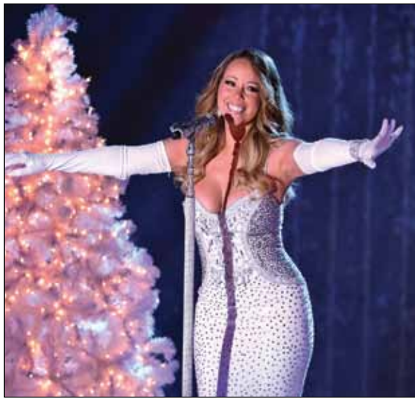
Mariah Carey performs her Christmas show at Toyota Center on Tuesday, Nov. 19, 2024, in Houston.