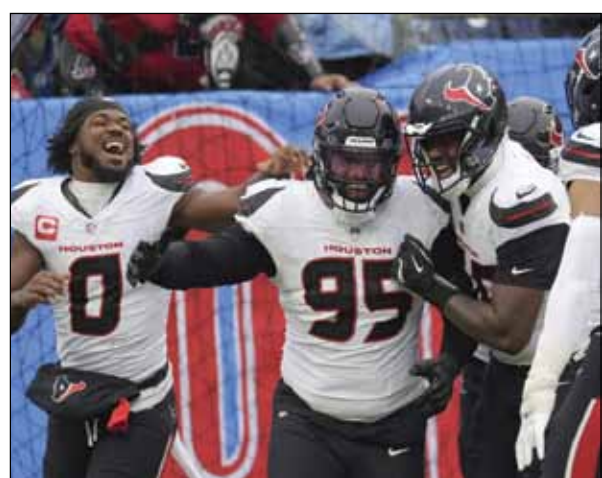
Houston Texans defensive end Derek Barnett (95) celebrates with teammates after returning a fumble for a touchdown against the Tennessee Titans during the second half of an NFL football game Sunday, Jan. 5, 2025, in Nashville, Tenn.