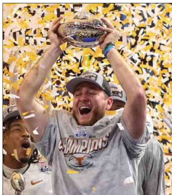
Texas Longhorns quarterback Quinn Ewers (3) holds up the trophy after a victory over the Arizona State Sun Devils in the Peach Bowl at Mercedes-Benz Stadium.

The University of Texas led 24-8 against Arizona State early in the fourth quarter, but a determined