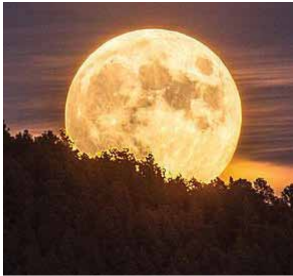
Three supermoons are on tap this year in October, November and December. The full moon will look particularly big and bright those three months as it orbits closer to Earth than usual.

The sun burped big time last year, painting the sky with gorgeous auroras in unexpected places.