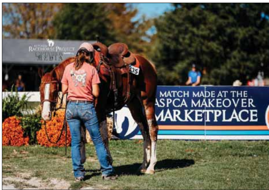
The Thoroughbred Makeover also serves as a horse shopping opportunity through the ASPCA Makeover Marketplace.