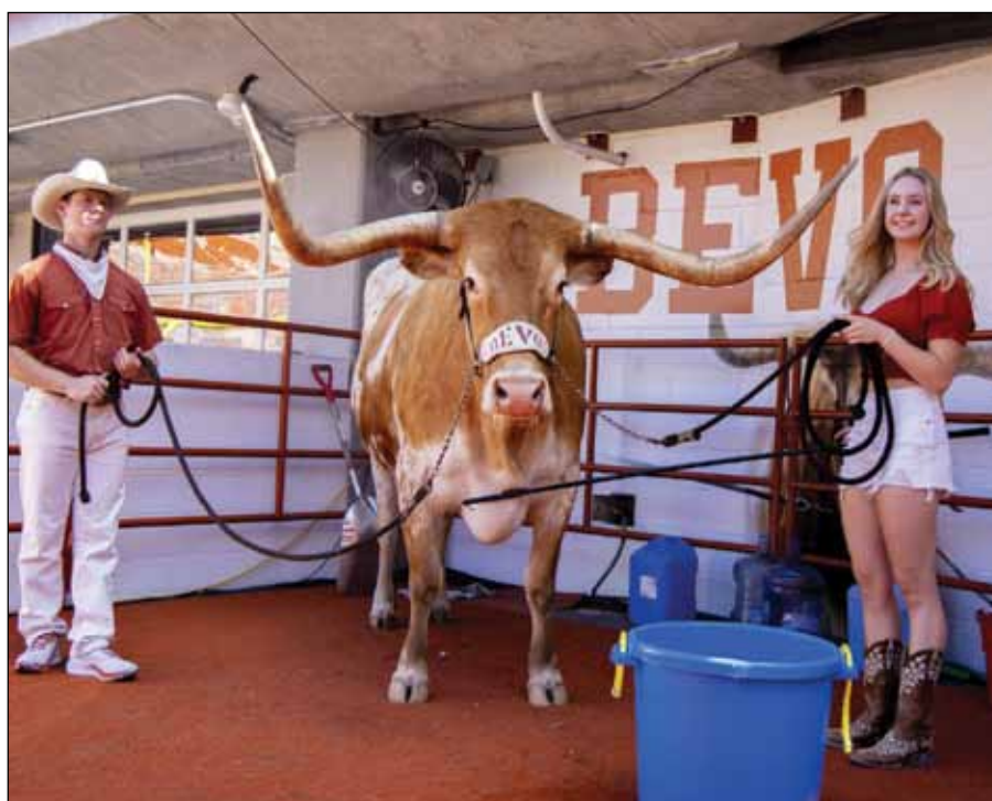
Texas' live longhorn mascot Bevo XV will be at the Cotton Bowl for Texas' College Football Playoff semifinal against Ohio State at AT&T Stadium in Arlington on Jan. 10 at 6:30 pm CT.

as we would love to be able to do it, the sideline space at Mercedes-Benz Stadium