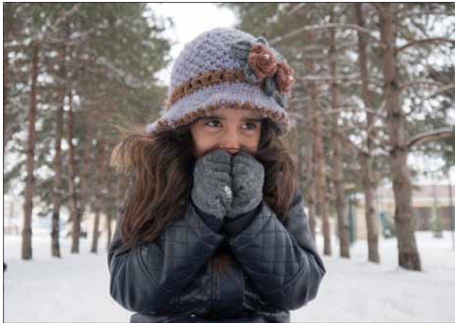
It's a cold air outbreak that some experts say is happening more frequently, and paradoxically, because of a warming world. Such cold air blasts have become known as the polar vortex.

"Think of it as like a rubber band at rest, kind of roundish," Cohen said. "If